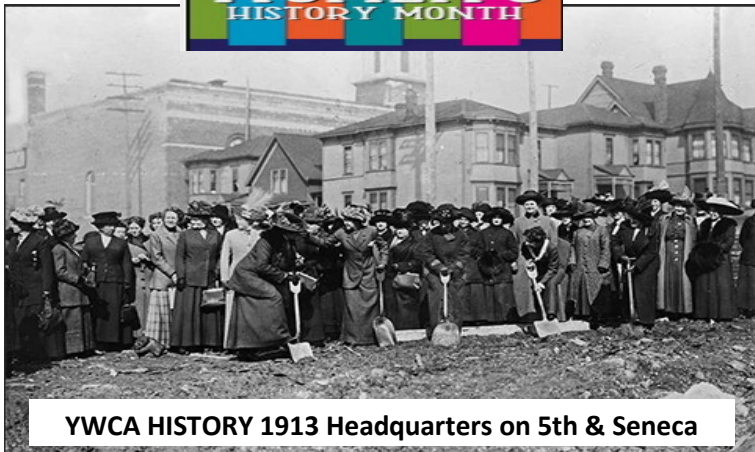
YWCA HISTORY 1913 Headquarters on 5th & Seneca